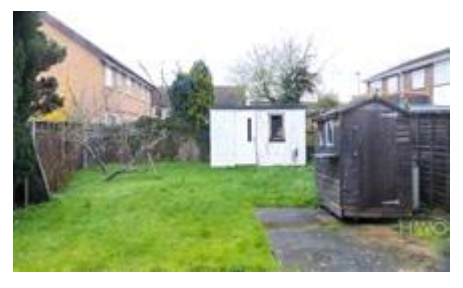
Rooms to rent in SM3 Postcoe 5 Bedroom house, fully furnished with bills included. Sharing with Prfessionals. 2 Bathrooms, Fully fitted kitchen.