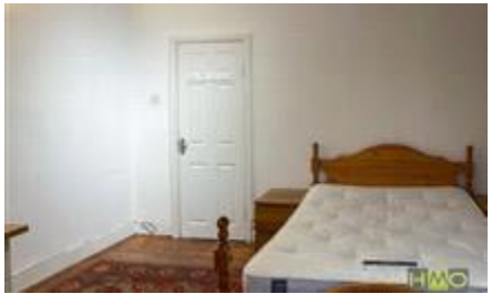
Darwin Road W5 £850 pcm