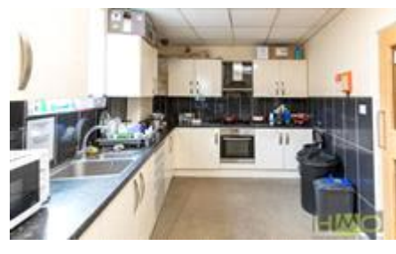
HMO Management Agency are offering students and professionals accommodation in Coventry which fitted and to meet your everyday needs!