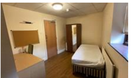
R3 - Gordon Street, Coventry £425 pcm