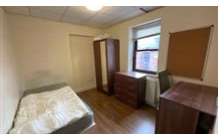
R4 - Gordon Street, Coventry £450 pcm