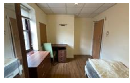
HMO Management Agency are offering students and professionals accommodation in Coventry which fitted and to meet your everyday needs!